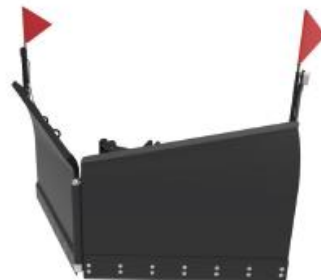
Dozer Blade "V"