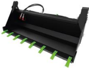
4 in 1 Bucket